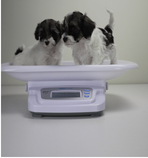
SMALL ANIMAL SCALE