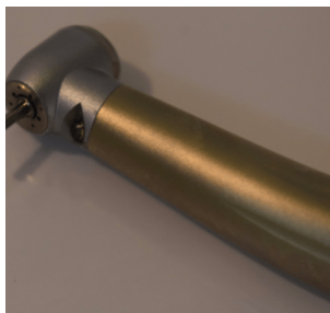
HI SPEED DENTAL DRILL W/ LED LIGHT

Categories: low speed drill / polisher , Dental Carts/Drills