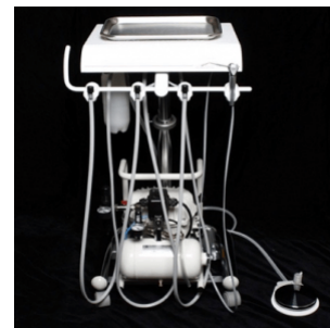
RELIANCE DENTAL CART & COMPRESSOR

Categories: Hi speed dental drills , drills