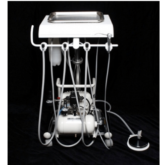
RELIANCE DENTAL CART & COMPRESSOR

Categories: Hi speed dental drills , drills